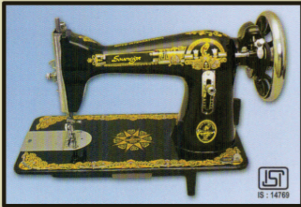
MODEL : DOMESTIC