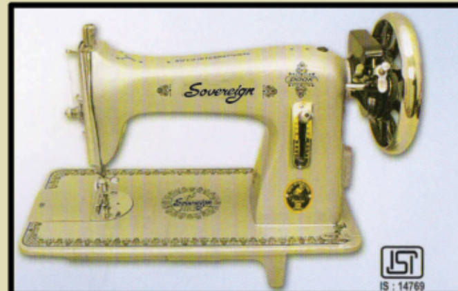
MODEL : POPULAR