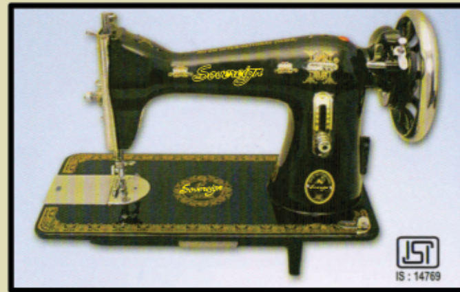
MODEL : TAILOR