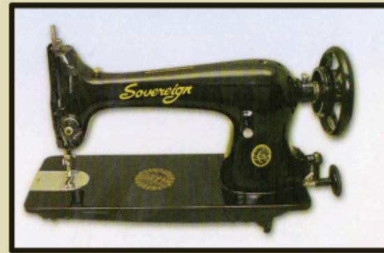
MODEL : SUPER STITCH 31K