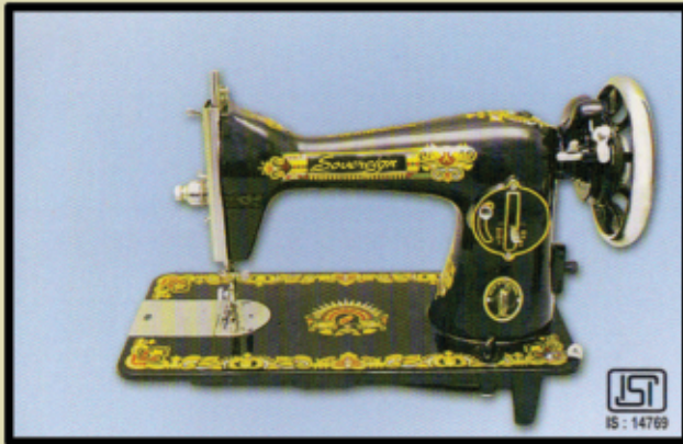
MODEL : DOOK CLASSIC