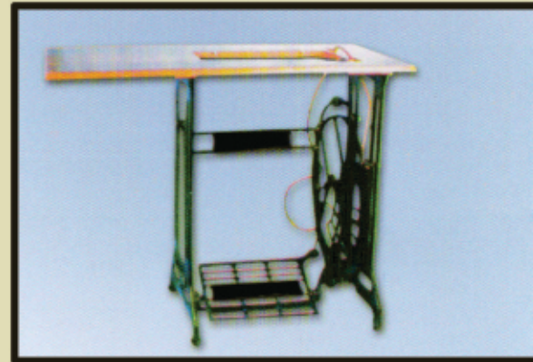
STAND AND TABLE