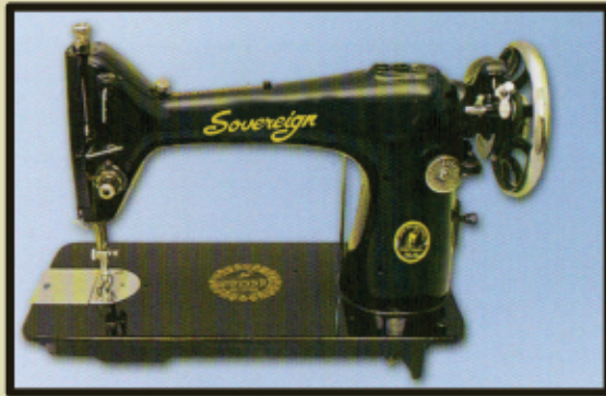
MODEL : HIGH POWER – UMBRELLA T.A. I